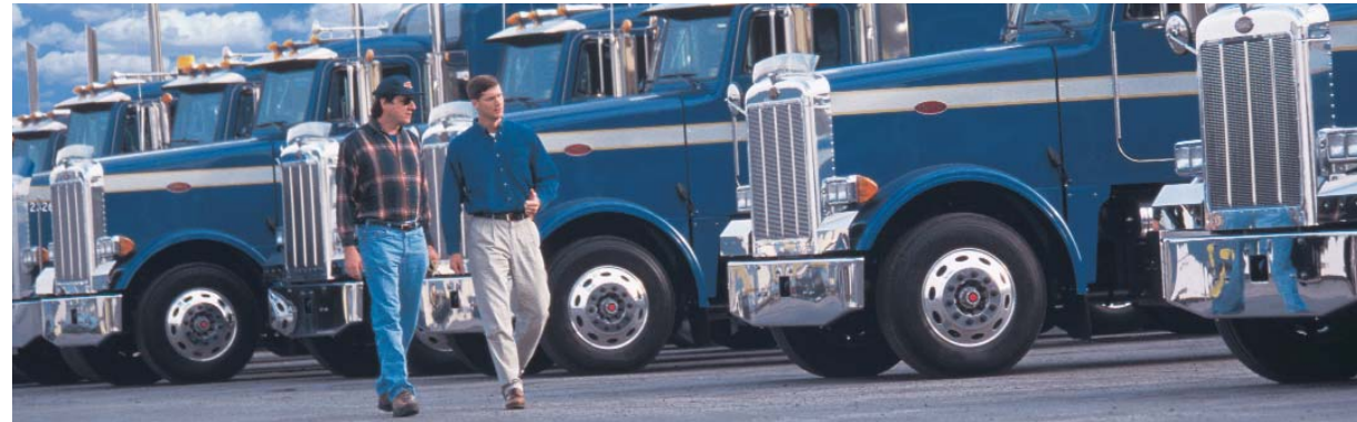
We take the time to understand your fleet maintenance needs and custom tailor an individualized service plan.