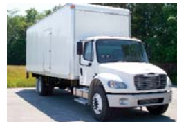
Cargo Box Trucks