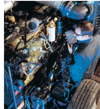
Accurate diagnosis and repair solutions.

accuracy in diagnosing your vehicle properly. We also ensure that your billing is correct.