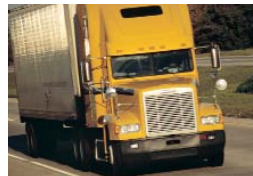
Tractors & Trailers

On site preventive maintenance and repair service is available for your fleet.